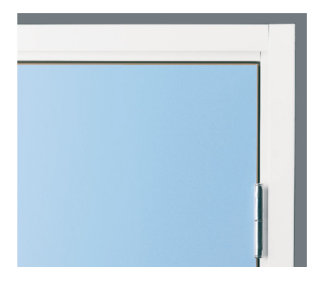
Protective edging around the whole door leaf that both protects and makes it easier to keep clean.