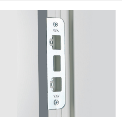
Striking plate for Assa 310 lock case.